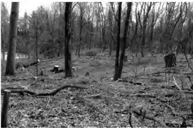
Figure 2. Underbrush was removed and a section of woods was clear-cut along the Chelsea driveway. [L.Lindberg]

Nassau County's response was not unexpected. According to Newsday (Dec. 27, 2012) the County's spokesman Michael Martino called it "preposterous to think Nassau County would allow any trees to be removed for reasons other than protecting the public's safety." He said if trees "meet certain criteria, such as 50 percent damage, a split trunk or broken branches . . . it is in the interest of public safety to remove the tree." However, officials acknowledge that a crew paid by the tree was mistakenly sent into Welwyn Preserve . . . accounting for the initial burst of tree cutting. "No way would I condone taking down trees arbitrarily," said legislative Presiding Officer Norma Gonsalves (R-East Meadow). "I have done my research . . . Those that posed a risk to people who use the preserve had to be removed." The Newsday story continues: After Legis. Judy Jacobs (D-Woodbury) asked about Welwyn, the Commissioner of Public Works sent a log of the preserve work. It shows that 31 trees had been uprooted and were on the ground when crews arrived on Nov. 25. . . Crews took down another 111 trees, primarily because of damaged crowns or because the tree was leaning dangerously. "We're all sad to see so many trees lost in a storm, but I'm happy to see that the work . . . is backed up with fact," Jacobs said.